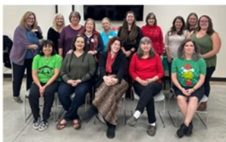
Extension Master Gardener SM Volunteers Montgomery County, North Carolina