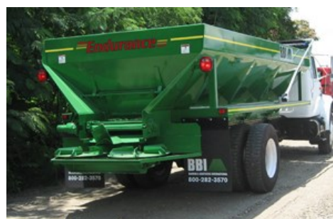
Striping from uneven litter application