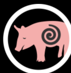
Diarrhea and vomiting