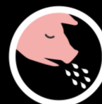
Coughing and difficulty breathing