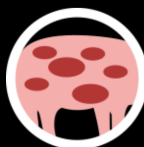
Red, blotchy skin, or skin lesions