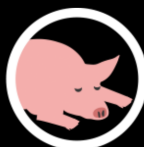
Decreased appetite and weakness