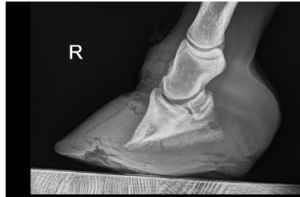
X-ray of the hoof of a horse with laminitis showing displacement of the coffin bone.

Radiographs are a helpful tool to observe the severity of the bone displacement. Once the bone rotates, the horse is considered to be foundering.