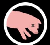
Abortions or sudden death

African Swine Fever action week was in October and the USDA Animal and Plant Health Inspection Service (APHIS) website reminds farmers of the importance of vigilance and biosecurity. The Protect our Pigs - Fight African Swine Fever! Key Take Aways: