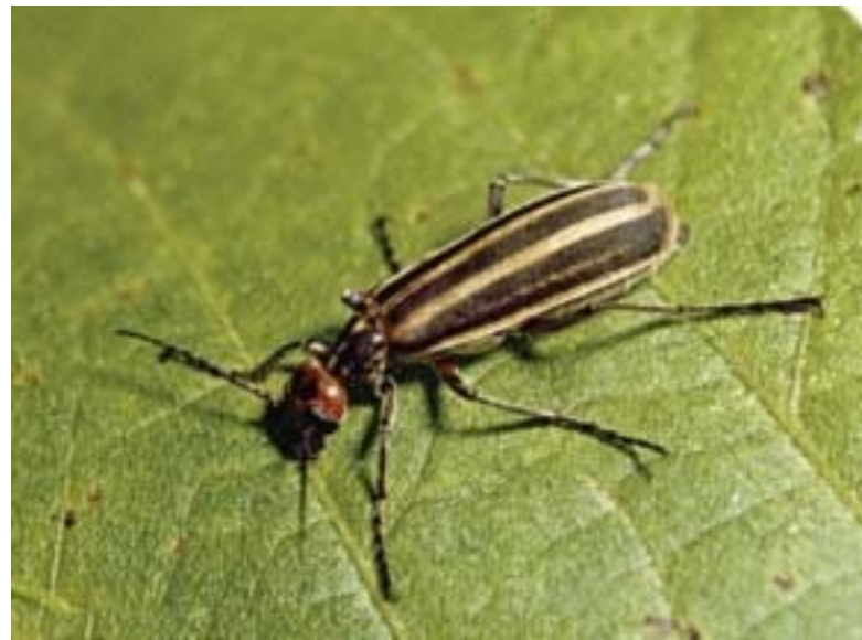
Blister beetle: Photo: Clemson University/USDA Cooperative Extension

mans and horses. They frequently make nests in eaves and window trim, so check these spots out first. Spiders are another one we are used to seeing in horse barns but not thinking about controlling. All spiders can bite if disturbed, according to entomologist Lee Townsend from the University of Kentucky. While not all spider bites are poisonous, they do inflict a wound that can easily become infected. Of course, black widows and brown recluses are a totally different story! Blister beetles are something we usually think about in hay. These beetles contain a chemical that is toxic to horses, and even touching them can poison your horse. Consuming too many can cause death, so this is something you need to be aware of. Oftentimes horses are exposed to these beetles when they are crushed in the hay making process; they are most often found in alfalfa hay, usually in later cuttings of hay. Your horse would have blisters in their mouth and GI tract if they consume these insects, reduced eating, and colic like symptoms. Contact your vet immediately if your horse consumes alfalfa hay and starts exhibiting these symptoms.